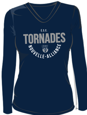
O-NA-L3520LS ( XS-2XL ) LADIES' PRO-FIT LS V-NECK Navy with 2 colour print