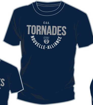
O-NA-S350 ( XS-4XL ) UNISEX PRO-FIT SS TEE Navy with 2 colour print