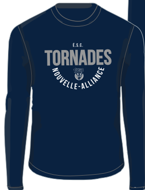
O-NA-Y350LS ( YXS-YXL ) YOUTH PRO-FIT LS TEE Navy with 2 colour print