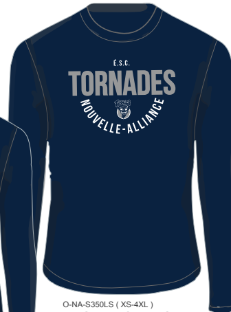
O-NA-S350LS ( XS-4XL ) UNISEX PRO-FIT LS TEE Navy with 2 colour print