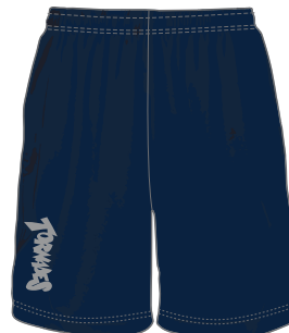
O-NA-2386 ( M - L ) UNISEX PRO-FIT SHORT Navy with silver grey print