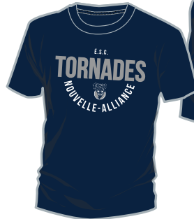
O-NA-Y350 ( YXS-YXL ) YOUTH PRO-FIT SS TEE Navy with 2 colour print