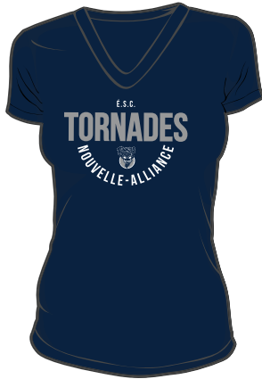
O-NA-L3520 ( XS-2XL ) LADIES' PRO-FIT SS V-NECK Navy with 2 colour print

APPROUVÉ : OUI NON COMMENTAIRES: _____ ( SI NON APPROUVE ) APPROUVÉ PAR: _____ DATE: _____