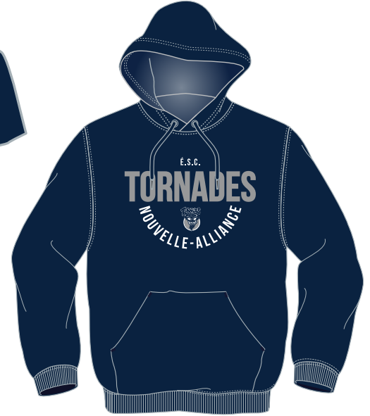
O-NA-F2500 ( XS-4XL ) UNISEX FLEECE HOODED SWEATER Navy with 2 colour print